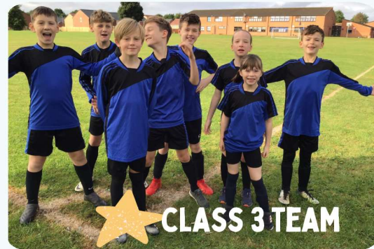
CLASS 3 TEAM

OUR CLASS 3 TEAM MADE IT TO THE FINAL AND CAME 1ST PLACE!