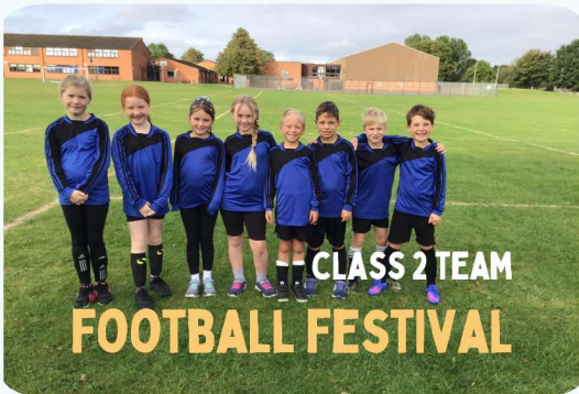
CLASS 2 TEAM